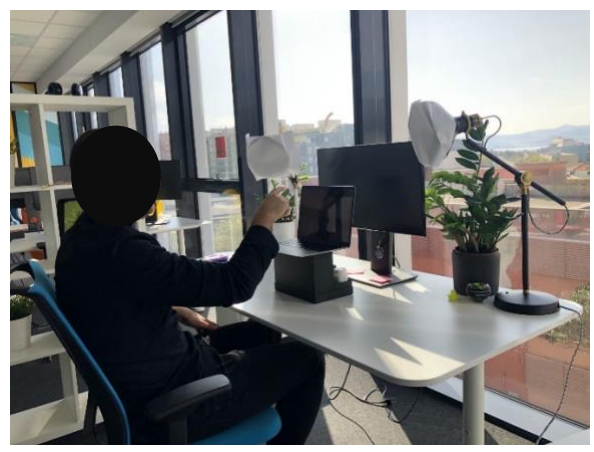
Perfect setup. Windows in front of you, light or lamps at eye height, and camera elevated.

This is one of the most important steps you must take. I cannot overstate the importance of lighting. Make sure you highlight this section.